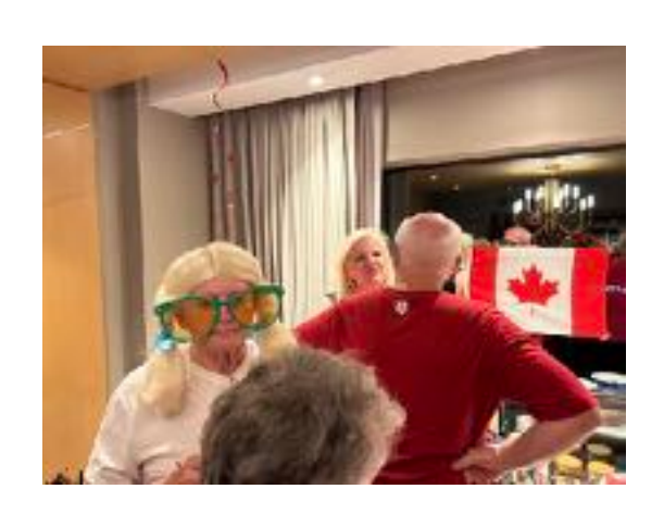
Canadian Hospitality Room